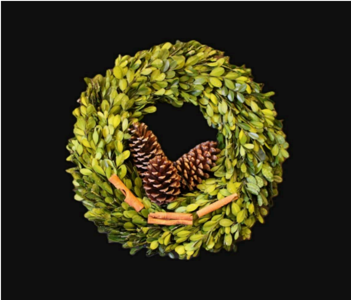
Class 2: Festival of Lights-creative (color)