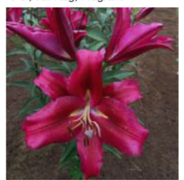
Redford 8 (OT) dk wine-red. 3-4', July/ Aug, Fragrant