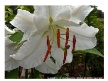
Casablanca 7 (Oriental) White. 5-6', Jul/ Aug, Fragrant