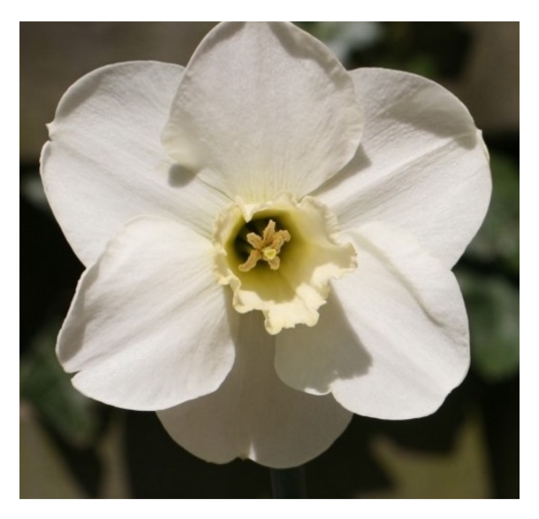
Green Arrow Daffodil