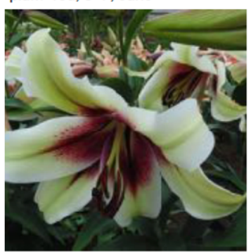
Zeba 8 (L. nepalense x O) white with with red-black centers. 3-4', July/Aug