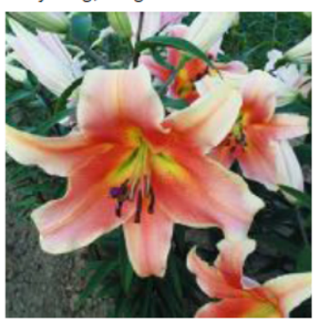
Zelmire 8 (OT) Salmon-coral, 3-4'. July, Fragrant