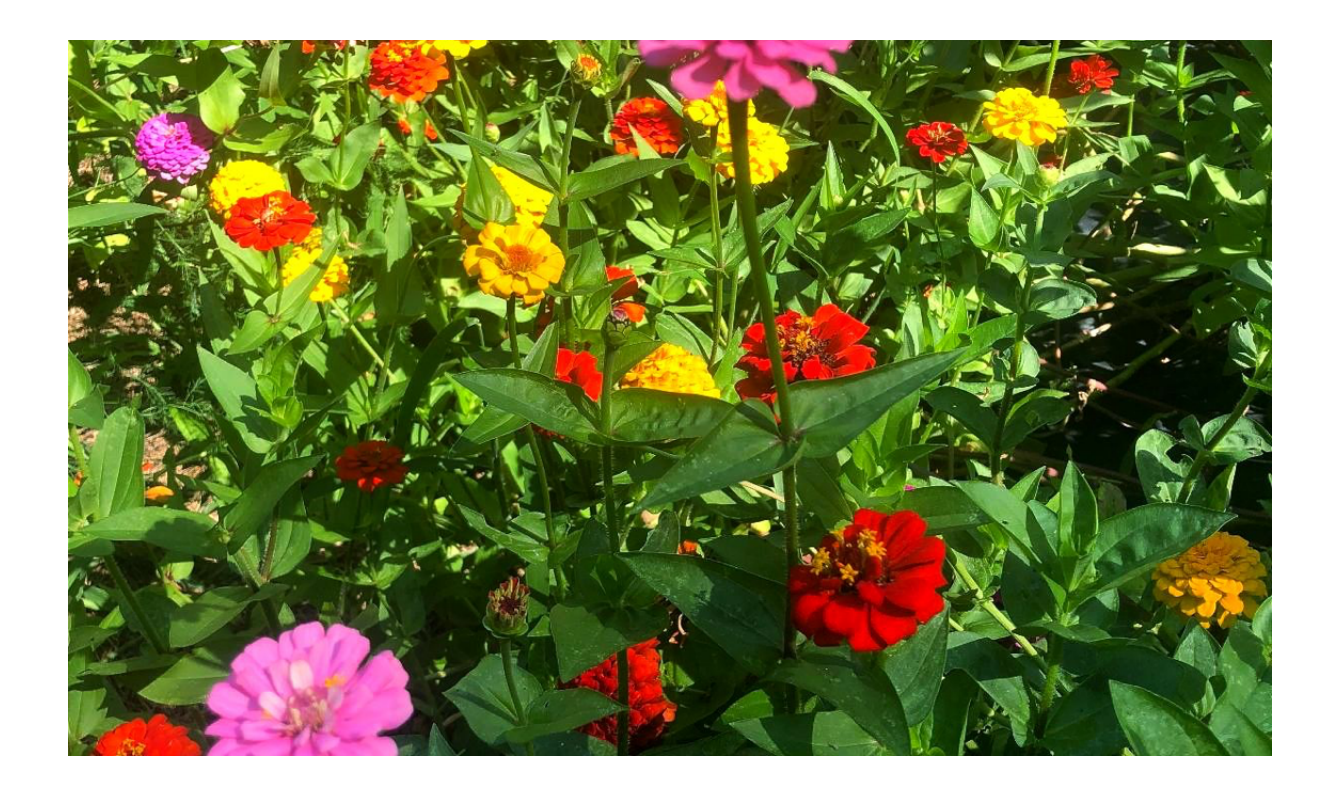
Zinnias soak up the summer sunshine.