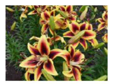
Viva la Vida 8 (AO) Golden yellow /red, 4', June-July