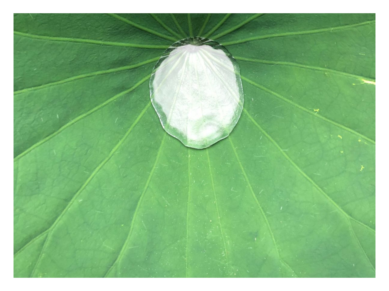
Raindrops gather into a delicate puddle in the center of a lotus leaf (Nelumbo nucifera).