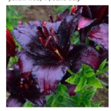
Secret Kiss 1a (Asiatic) Dk. plum- red, 3-4', June