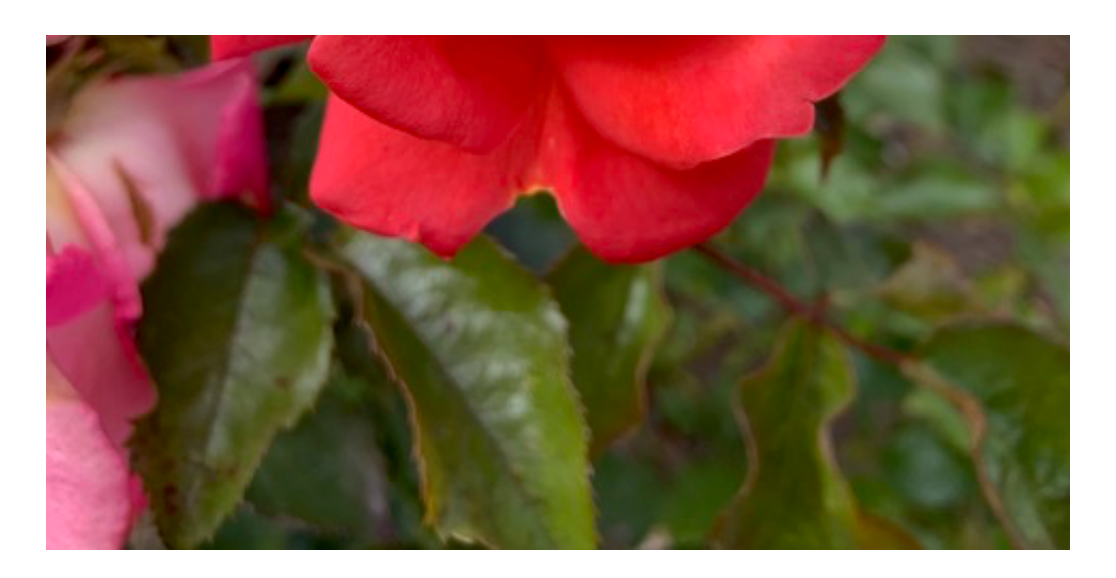
A gorgeous rose in Patagonia.