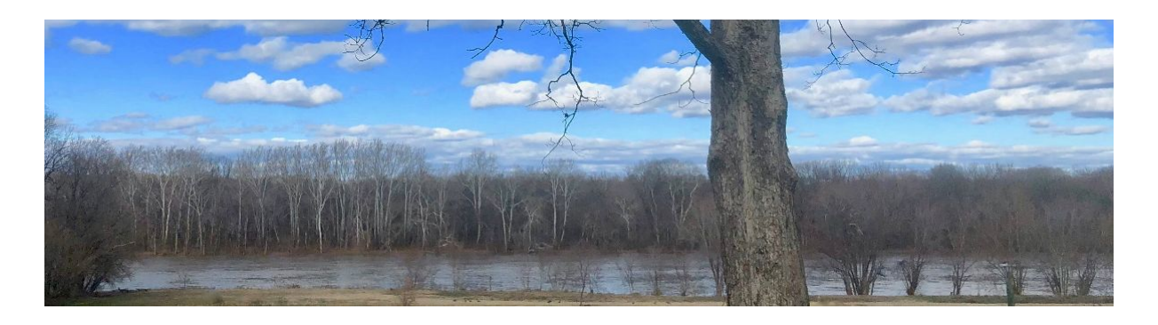
Late winter vista of the James River.